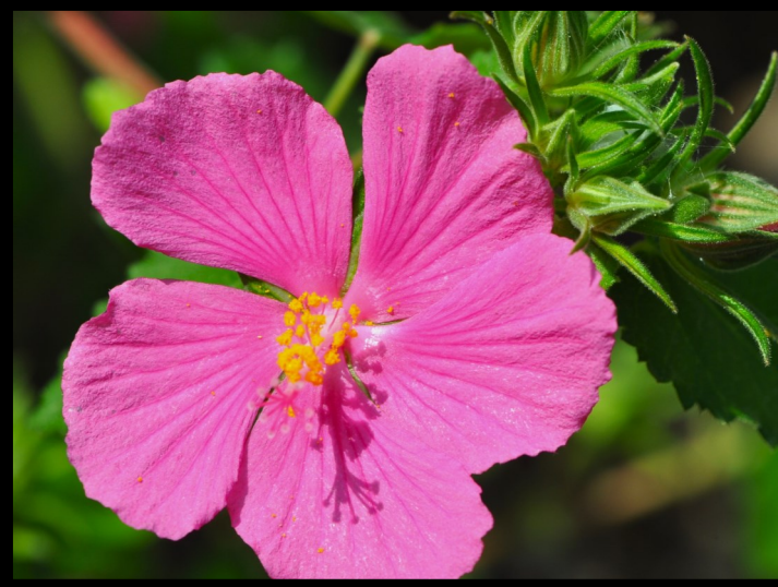
Rose Rose Pavonia lasiopetala